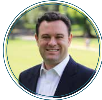
The Hon John Barilaro Deputy Premier Minister for Regional NSW Minister for Skills Minister for Small Business

I encourage communities and organisations across our regions to take advantage of this incredible opportunity.