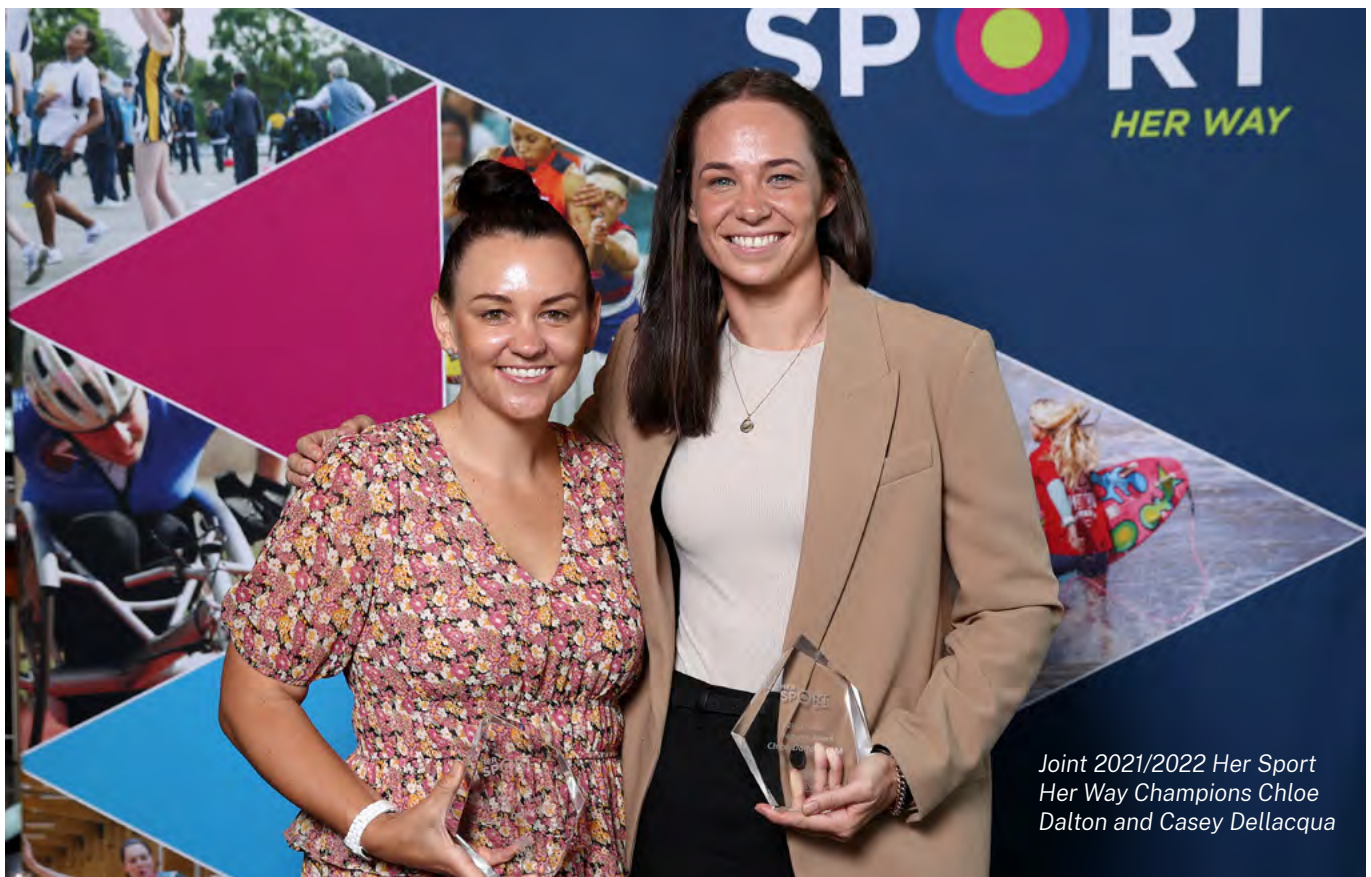
Joint 2021/2022 Her Sport Her Way Champions Chloe Dalton and Casey Dellacqua

The awards will be presented in mid 2023.