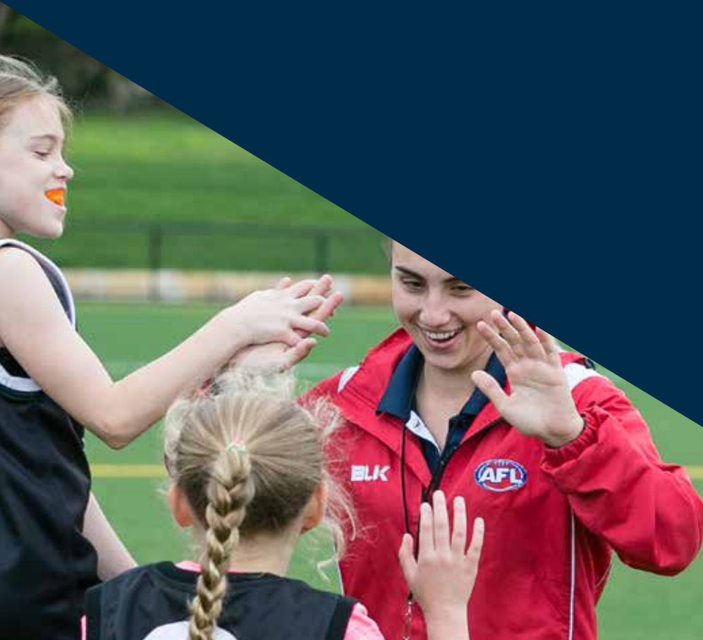
The Hon Geoff Lee MP Acting Minister for Sport

A handwritten signature in white ink that reads "Geoff Lee". The signature is fluid and cursive.