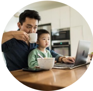
Working From Home