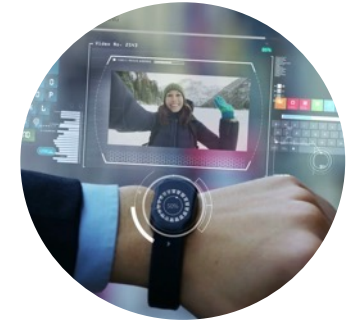
The Virtual Office