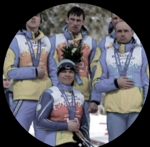
Olympic and Athlete protests