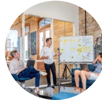
The Workplace Village