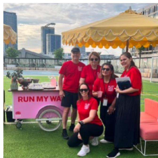
Run My Way market research team