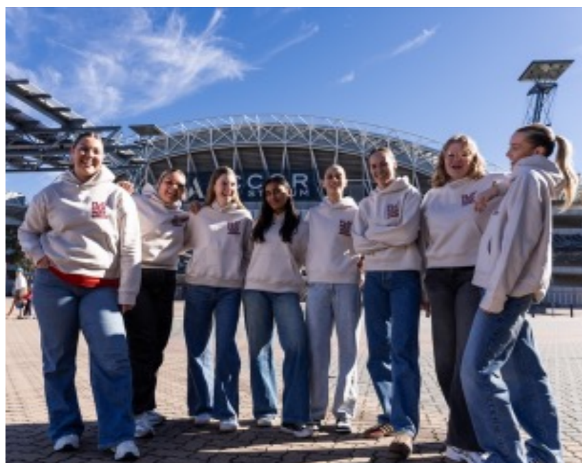
Teenage Advisory Committee (TAC)

Through regular meetings and consultations, the TAC is influencing the Office of Sport's approach, helping ensure strategies are relevant, impactful and informed by the real experiences of adolescent girls and young women.