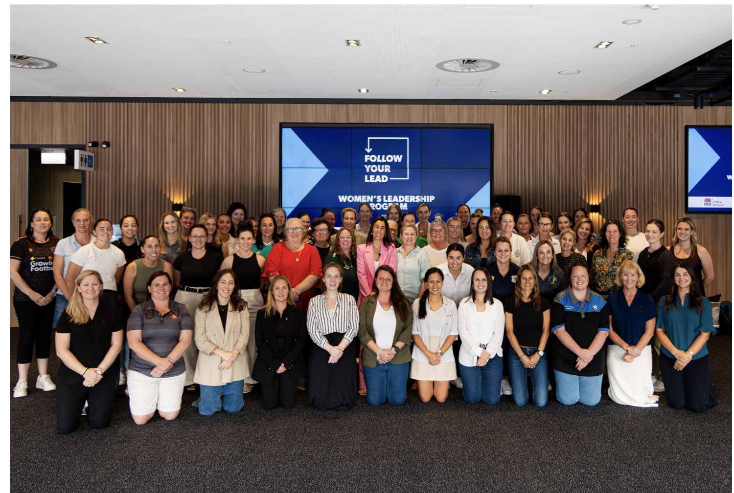
Follow Your Lead: Women's Leadership Event 2025

You can hear more about the Women in Leadership program here.