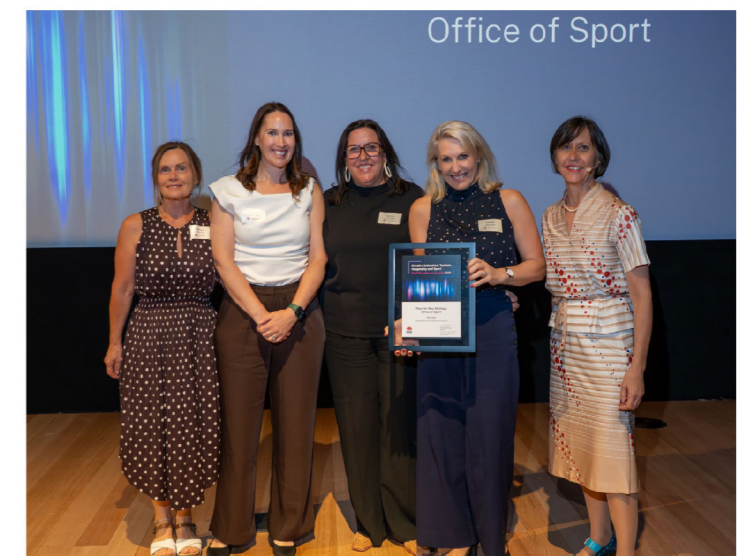
Play Her Way Strategy team at the 2025 Creative Industries, Tourism, Hospitality and Sport Staff Excellence Awards.

To round out the work in 2025, the Play Her Way Strategy team was recognised in the 2025 Creative Industries, Tourism, Hospitality and Sport Staff Excellence Awards. We are overjoyed that our creative and sometimes non-conventional approach has been recognised in the Staff Excellence Awards. We love helping the girls and women of NSW shine and this award is testament to the power of listening to female voices across the State.